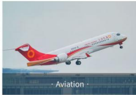
· Aviation ·