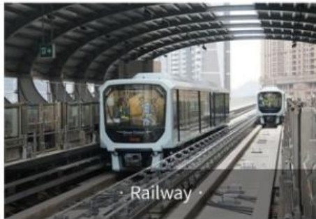
· Railway ·