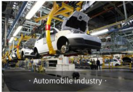
· Automobile industry ·