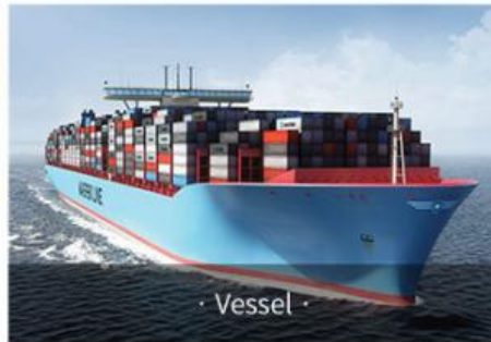
· Vessel ·