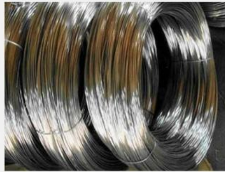
Stainless steel bright wire is applied in petroleum, electronics, machinery and construction, etc.